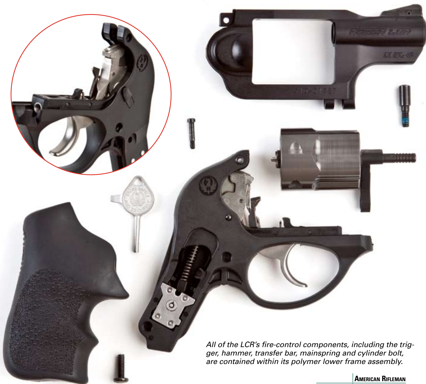
All of the LCR's fire-control components, including the trigger, hammer, transfer bar, mainspring and cylinder bolt, are contained within its polymer lower frame assembly.

Ruger has shot the LCR extensively without this second screw and without any ill effects, so it may be unnecessary. But when crossing into unknown territory,