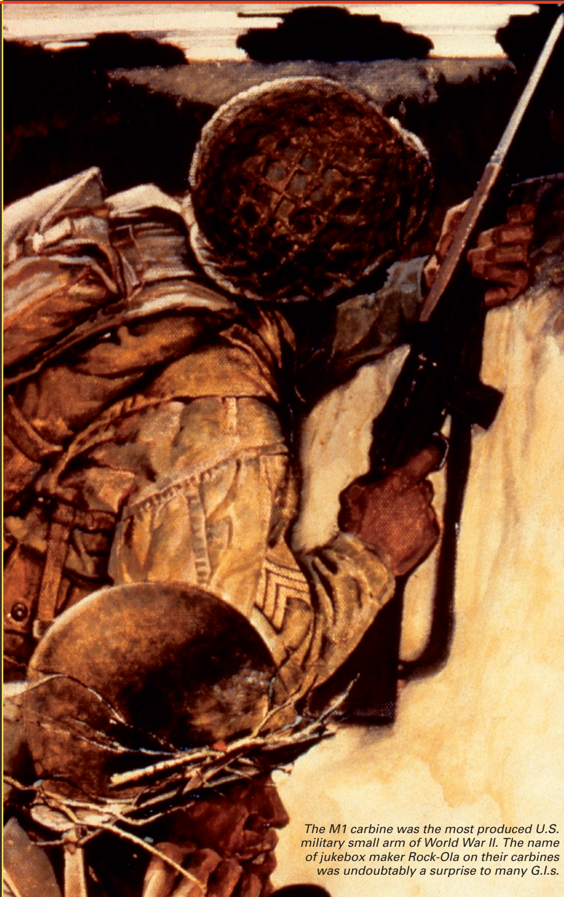
The M1 carbine was the most produced U.S. military small arm of World War II. The name of jukebox maker Rock-Ola on their carbines was undoubtably a surprise to many G.I.s.