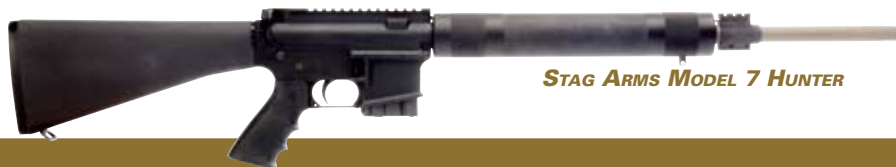
STAG ARMS MODEL 7 HUNTER