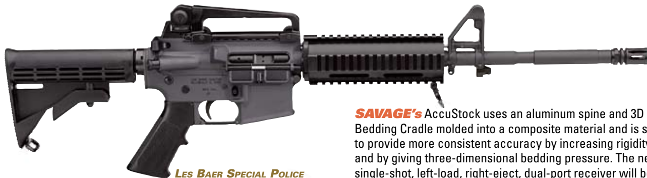
LES BAER SPECIAL POLICE

SAVAGE's AccuStock uses an aluminum spine and 3D Bedding Cradle molded into a composite material and is said to provide more consistent accuracy by increasing rigidity and by giving three-dimensional bedding pressure. The new single-shot, left-load, right-eject, dual-port receiver will be available on the Model 12 Long Range Precision Varminter and on the new Model 12 Benchrest, which is designed for 1,000-yd. benchrest competition. It features a 29" extra-heavy barrel, target AccuTrigger and a laminate stock with a wide, flat fore-end. www.savagearms.com