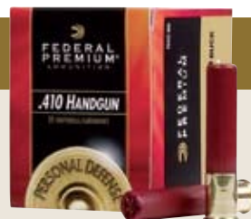
FEDERAL .410 HANDGUN