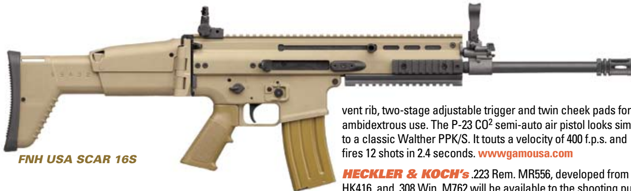
FNH USA SCAR 16S

a short-stroke gas piston operating system and has a fully adjustable, side-folding stock and ambidextrous controls. Also new is the FNAR, a 7.62x51 mm NATO precision rifle based on the Browning BAR sporting rifle. It features multiple Picatinny rail attachment points and a 20" barrel available in either standard or heavy contours with a hard-chrome bore. The PS90 RD bullpup in 5.7x28 mm has an ultra-compact C-More reflex sight. And a new Five-SeveN 5.7x28 mm pistol variant is equipped with a fixed C-More combat sight. www.fnhusa.com