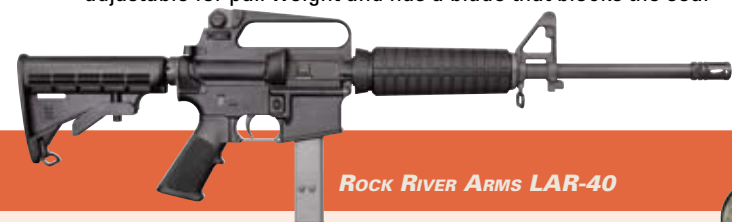
ROCK RIVER ARMS LAR-40

MOSSBERG's new .308 Win. 100 ATR Night Train 2 is equipped with the Lightning Bolt-Action (LBA) adjustable trigger and features a muzzle brake, Harris bipod, Barska 6-24X 60 mm scope and neoprene comb-raising kit. The LBA trigger is adjustable for pull weight and has a blade that blocks the sear