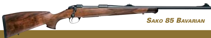
SAKO 85 BAVARIAN

for .38 Spl. +P ammunition. The LCR's grip peg accepts either the standard Hogue Tamer stocks with Sorbothane inserts or a Crimson Trace LaserGrip. www.ruger-firearms.com