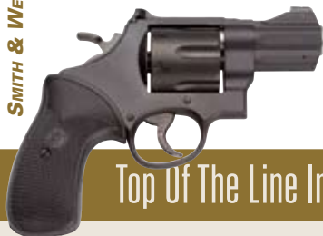
SMITH &amp; WESSON MODEL 357

TAURUS combined elements from the 800, 24/7 and 24/7 OSS series in the new .45 ACP 2045 pistol. It is available with either a blue or stainless steel slide. The .22 LR 22PLY and the .25 ACP 25PLY polymer-frame, double-action, tip-barrel