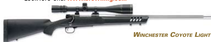
WINCHESTER COYOTE LIGHT

CHARTER ARMS' Rimless Revolver (CARR) is rated to handle +P loads and is chambered in 9 mm Luger, .45 ACP and .40 S&W, the latter of which will be offered first. The CARR uses no moon/half moon clips. The 2"-barreled 9 mm Luger version is built on the aluminum-frame Undercover, and the .40 S&W and .45 ACP versions are based on the larger Bulldog frame and have 2.2" barrels. The .327 Federal Mag. Patriot is a stainless steel, six-round-capacity revolver with the choice of 2.2"- or