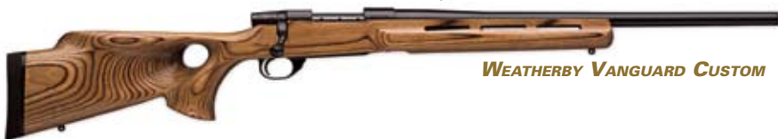
WEATHERBY VANGUARD CUSTOM

WINCHESTER REPEATING ARMS brings back two variants in the venerable controlled-round-feed Model 70 line that existed before its hiatus—this time with the M.O.A. no-creep, no-overtravel trigger assembly. The high-gloss Super Grade has a fancy-grade walnut stock with shadow-line cheekpiece, fine-cut checkering, a blued steel crossbolt and a one-piece bottom metal assembly. Chamberings include .270 WSM, .300 WSM, .270 Win., .30-'06 Sprg. and .300 Win. Mag. The Coyote Light varmint rifle has a matte blue receiver and a medium-heavy, fluted stainless steel barrel set in a black carbon fiber/fiberglass Bell & Carlson stock with ventilation slots in the fore-end. Chamberings include .22-250 Rem., .243 Win., .308 Win., .270 WSM, .300 WSM and .325 WSM. The company will also offer a limited-production Model 1895 Safari Centennial High Grade in honor of the 100th anniversary of Teddy Roosevelt's famous 1909 safari to Africa. www.winchesterguns.com