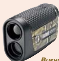
BUSHNELL LEGEND 1200 ARC

BARRETT'S Optical Ranging System or BORS is now available for several of Leupold's Mark IV tactical riflescopes. The unit has three internal sensors that allow it, after programing in temperature, barometric pressure and range, to not only calculate drop but actually adjust the scope for a first-shot hit. www.barrettrifles.com