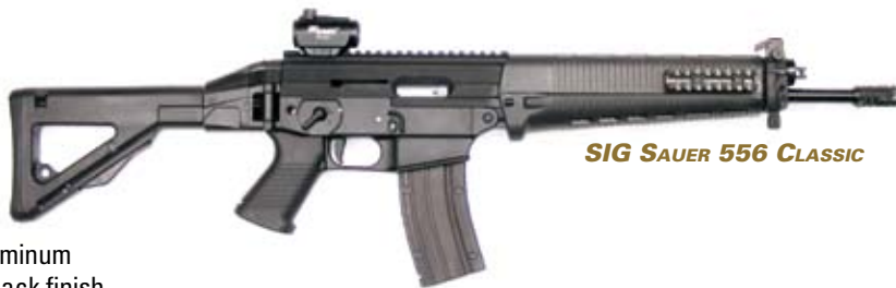
SIG SAUER 556 CLASSIC

Guard. The former is a J-frame revolver with an aluminum alloy frame, integral hammer shroud and a matte-black finish. The latter is part of the company's "Night Guard" series and is chambered in .41 Mag. It features a Scandium alloy frame and tritium sights. The Pro Series Model 632 Carry Comp is chambered in the .327 Federal Mag. cartridge and has a 3" barrel with a "PowerPort" expansion chamber. S&W has added the ambidextrous thumb safety option in compact and full-size variants of M&P polymer pistols chambered in 9 mm Luger, .40 S&W and .357 Sig. www.smith-wesson.com