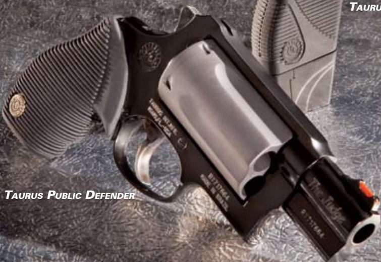
TAURUS PUBLIC DEFENDER